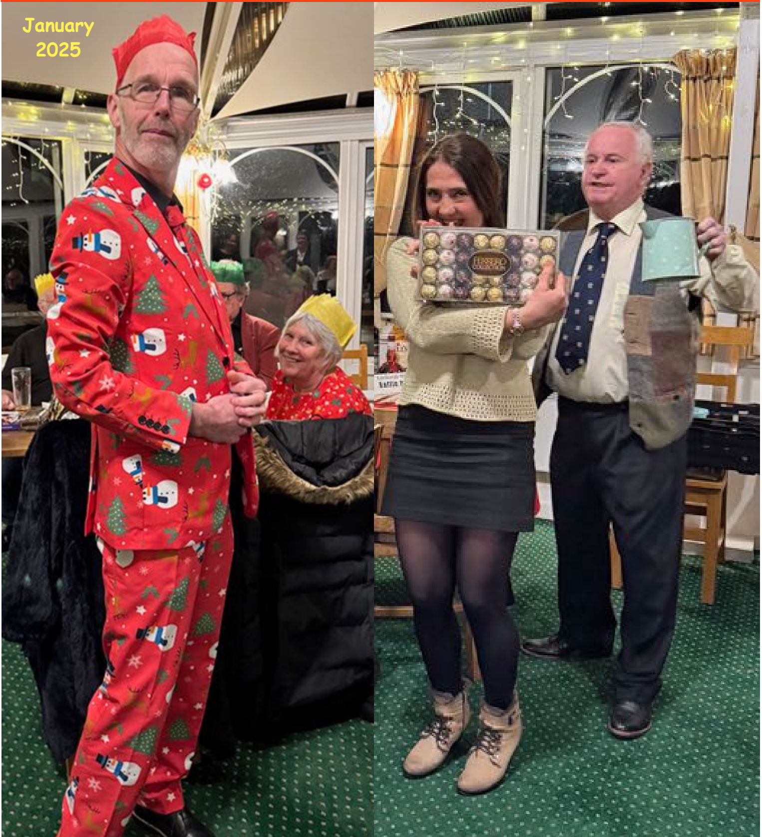
Festive Fun at the Christmas Dinner